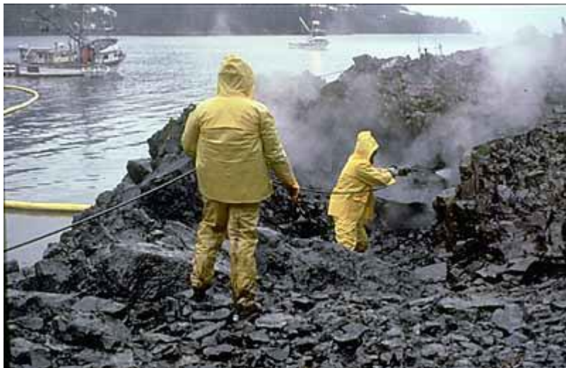
Oil spill cleaning equipment & washing

The SC Series, AF models offer the most versatile hot water pressure washers on the market today. Each skid allows the operator to vary the flow of the machine and reliably handle a two-gun set-up. The system is engineered to uniquely balance 1 or 2 gun operations. This series is powered by industrial engines, hi torque–low RPM belt driven pumps and a burner system with a 2.9Kw generator, providing clean, reliable 115V power for sustained burner operation. Simply add the second gun/hose kit (part# AVG53) if needed for second operator.