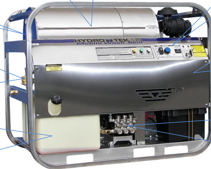
*Pictured with optional stainless steel frame PN: HS215

Industrial duty pump is designed to hold up under the demands of heavy duty every day use