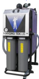
ZVAC – Truckbed/Trailer mounted Recycle System