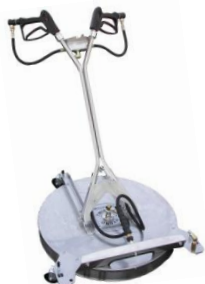
ANT3C Contractor Surface Cleaner

AHB12 – wheel kit with pull bar steering