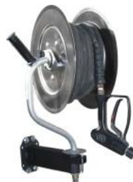
AR425 pivoting hose reel