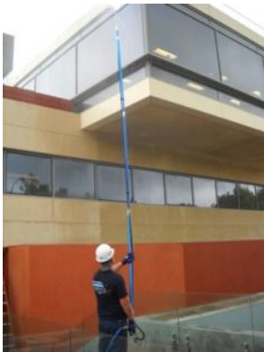
AVW20 High Reach Wash Pole

AHB12 – wheel kit with pull bar steering